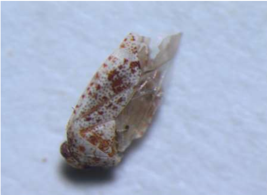
Figure 1 - Habitus of Yotvata nergal Linnavuori, 1993

Distribution of World: Iraq, Uzbekistan, Turkmenistan (Kerzhner & Kanstantinov, 1997).